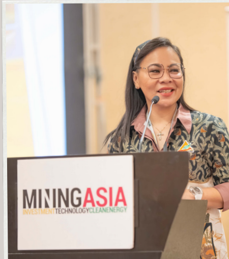
Mining Asia Conference & Expo (23 - 24 June 2026) Singapore