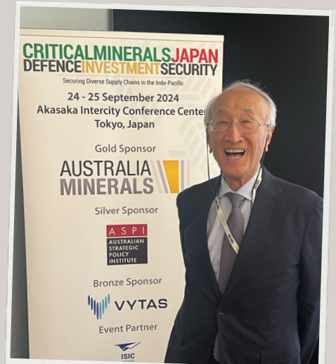
Critical Minerals Japan Conference & Exhibition (8 - 9 September 2026) Tokyo, Japan