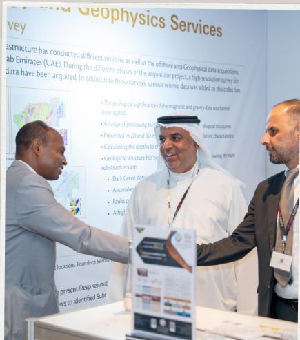
Mining & Critical Minerals Middle East Conference & Expo (16 - 17 September 2026) Dubai, United Arab Emirates