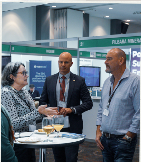
Critical Minerals Australia Conference & Exhibition (20 - 21 May 2026) Perth, Australia