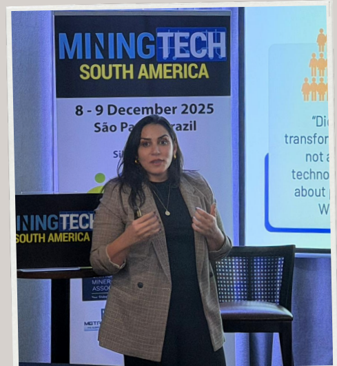
MiningTech South America Conference & Exhibition (1 - 2 October 2026) São Paulo, Brazil

Scan here for our full 2026/2027 events calendar