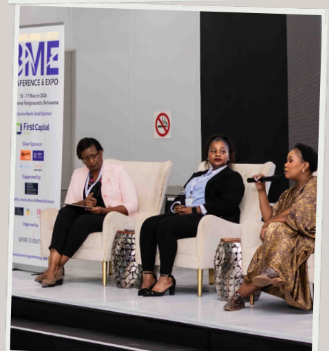
Botswana Mining & Energy (BME) Conference & Expo (22 - 23 March 2027) Gaborone, Botswana