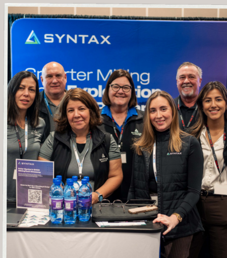
MiningTech North America Conference & Expo (16 - 18 November 2026) Vancouver, BC, Canada